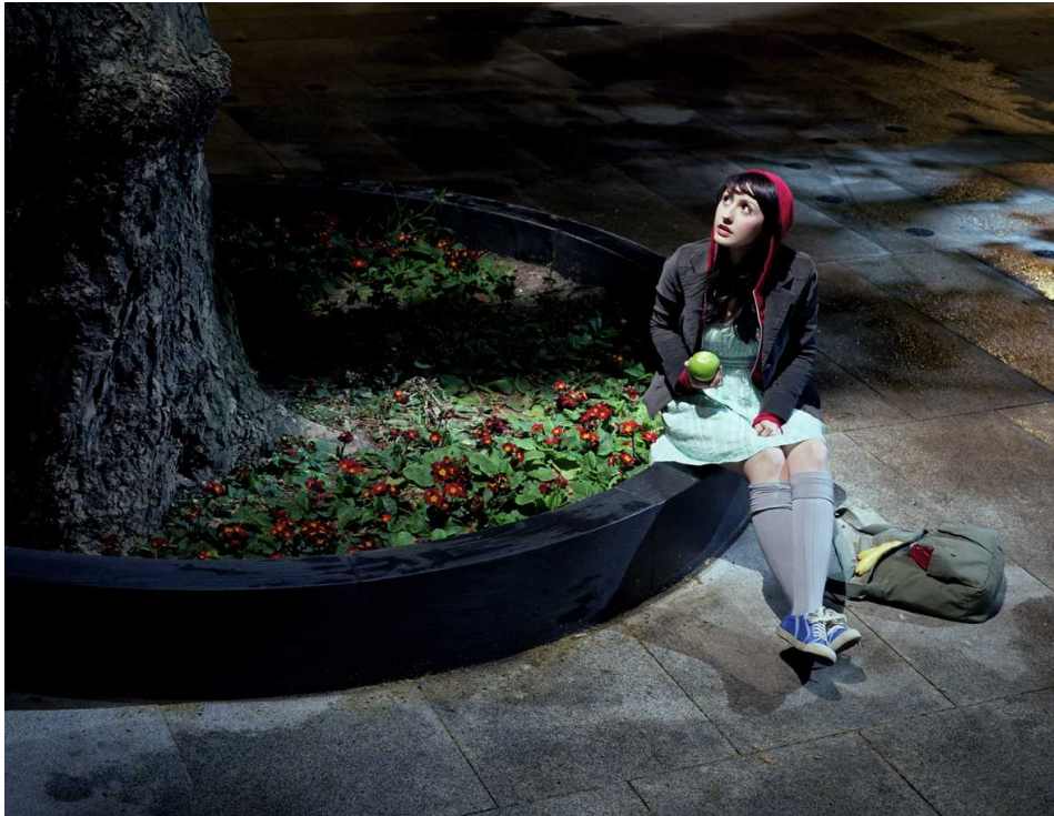
Hana Vojáčková Untitled (from the Ridinghood in East End series) 2007 C-type Print